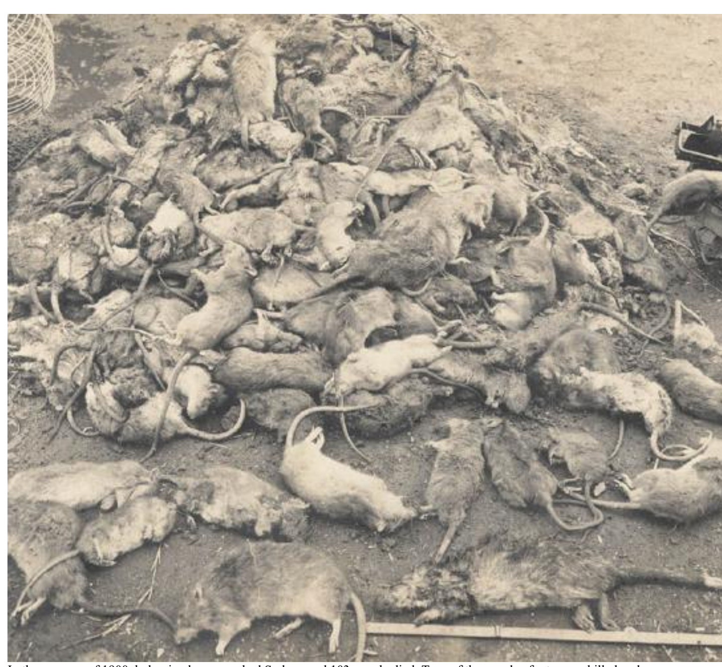
In the summer of 1900, bubonic plague reached Sydney and 103 people died. Tens of thousands of rats were killed and incinerated.