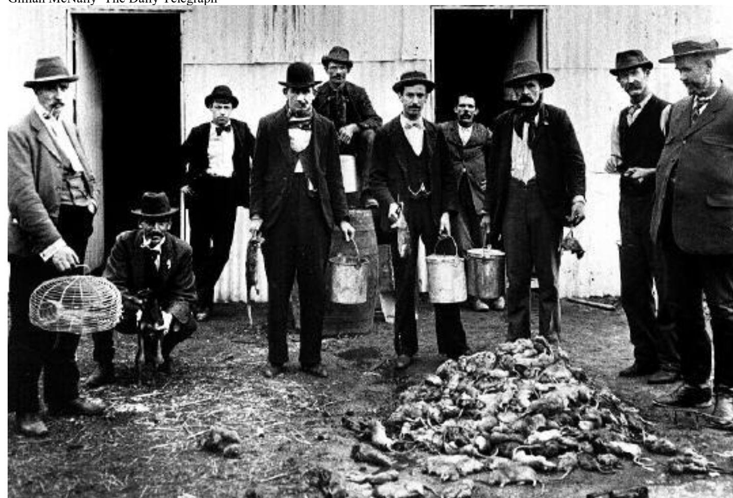
Rat catchers with a pile of dead vermin in Sydney in 1900. Rats were fetching up to six pence a head during the outbreak.

September 3, 2015 10:21am Gillian McNally The Daily Telegraph