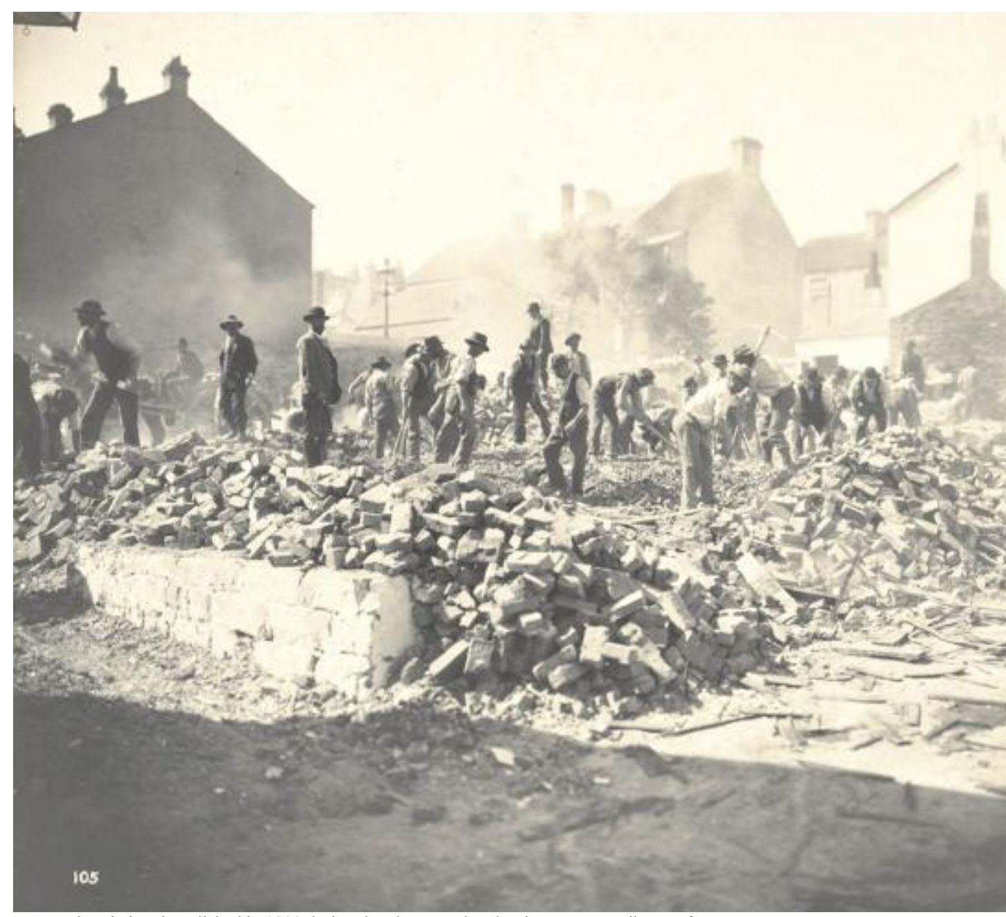
Exeter Place being demolished in 1900 during the plague outbreak.

The NSW Government took back ownership of virtually the entire headland from Circular Quay to Darling Harbour and demolished hundreds of slum houses and businesses in what are now prime real estate precincts such as George St, Sussex St, Kent St and Martin Place.