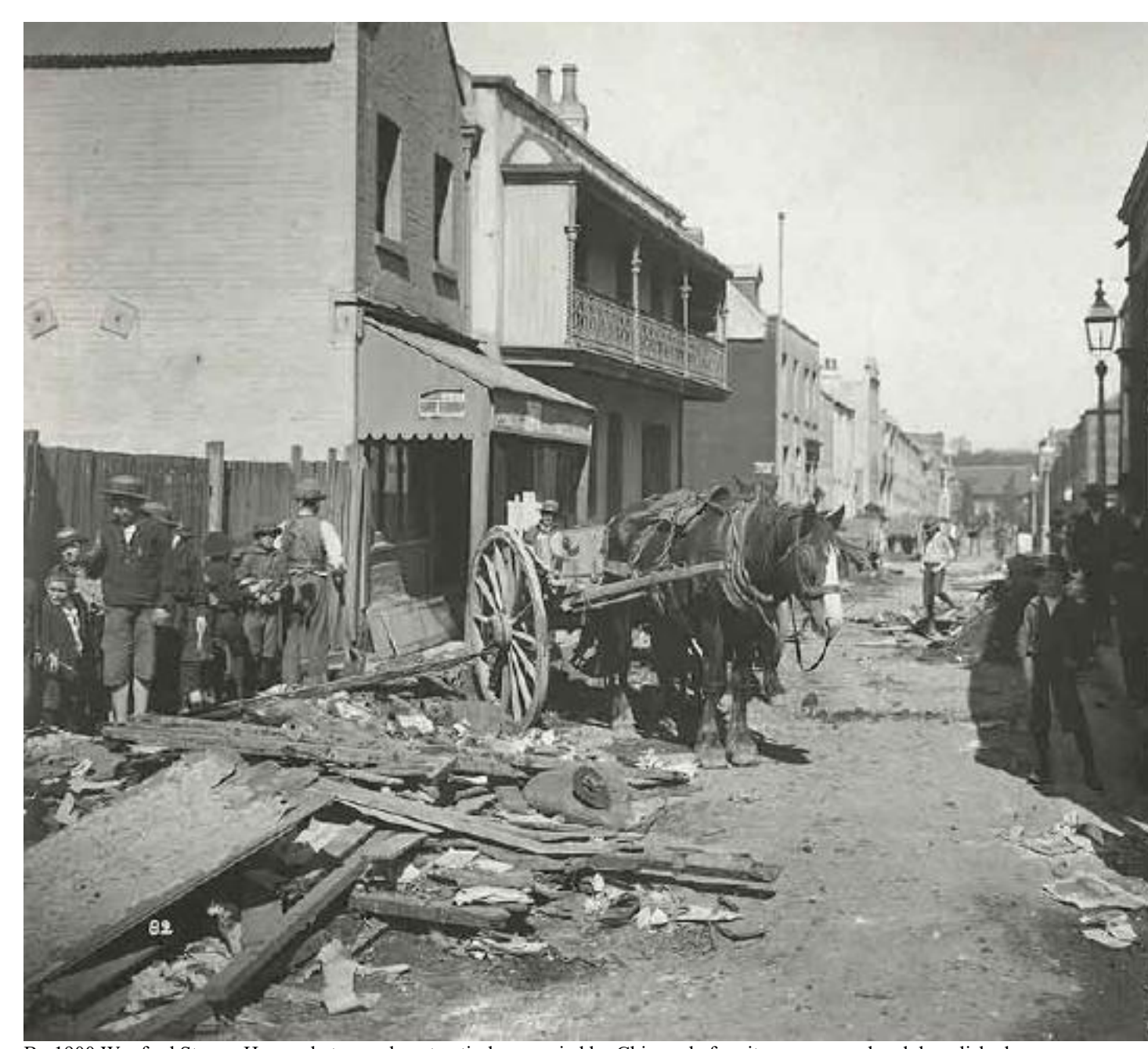
By 1900 Wexford St near Haymarket was almost entirely occupied by Chinese before it was resumed and demolished.

Within a few months of Captain Dudley's death, the plague had spread along transport routes across the city and quarantine areas were established from Millers Point west to Chippendale and Glebe, as far east as Paddington and Manly in the north.