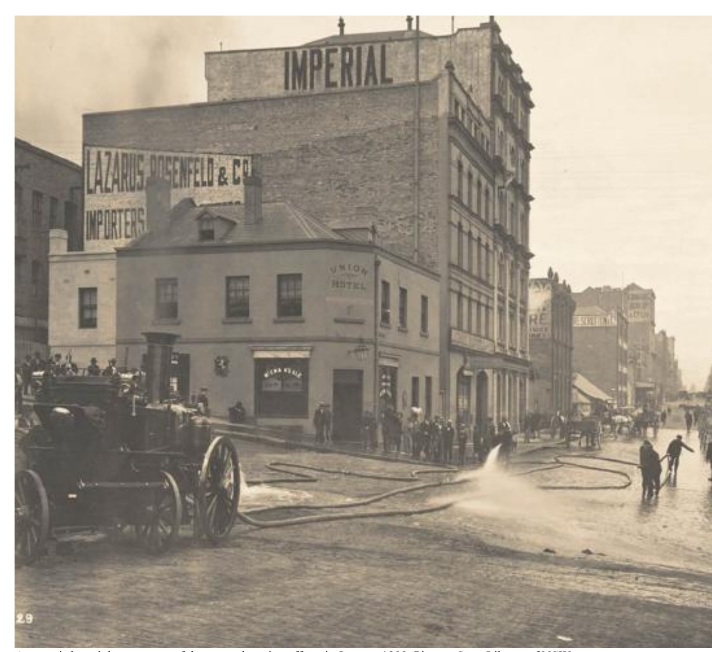
A street is hosed down as part of the mass cleansing efforts in January 1900.

For the next eight months, Sydney would be a city under siege.