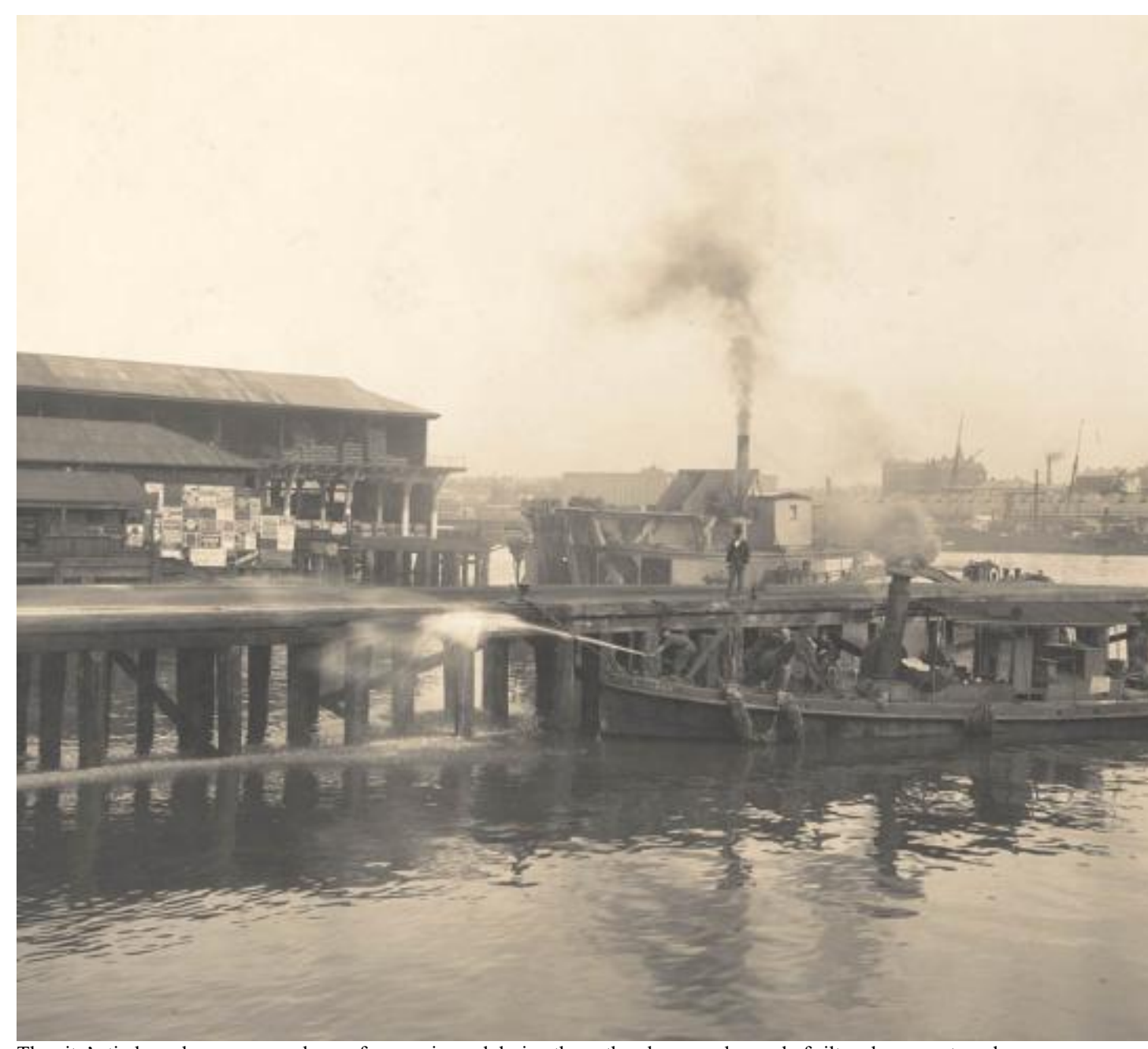
The city's timber wharves were a haven for vermin, and during the outbreak, were cleansed of silt and sewage to reduce the rat population.

Most virulent in the harbourside slums around Darling Harbour, those who could afford to fled the city and real estate agents were inundated with calls for suburban properties.