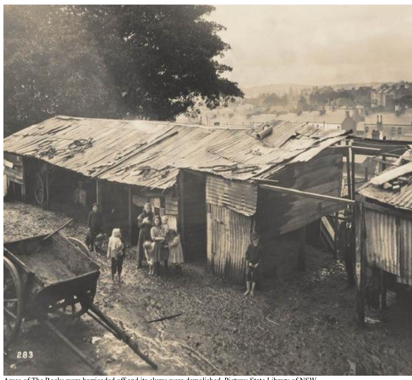
Areas of The Rocks were barricaded off and its slums were demolished.