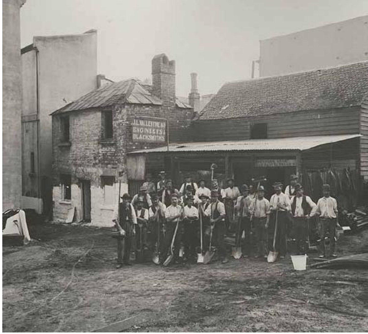
A gang of men during the cleansing of Sussex St, Sydney.